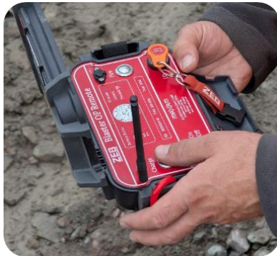
ZEB Blaster OP Remote